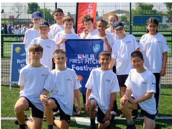
Some of our Year 6 children took part in the Liverpool Trojans Baseball Club Youth Festival.