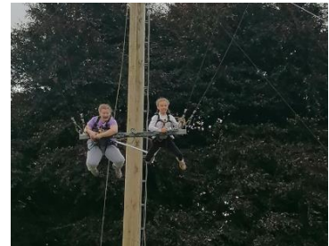
The Giant Swing