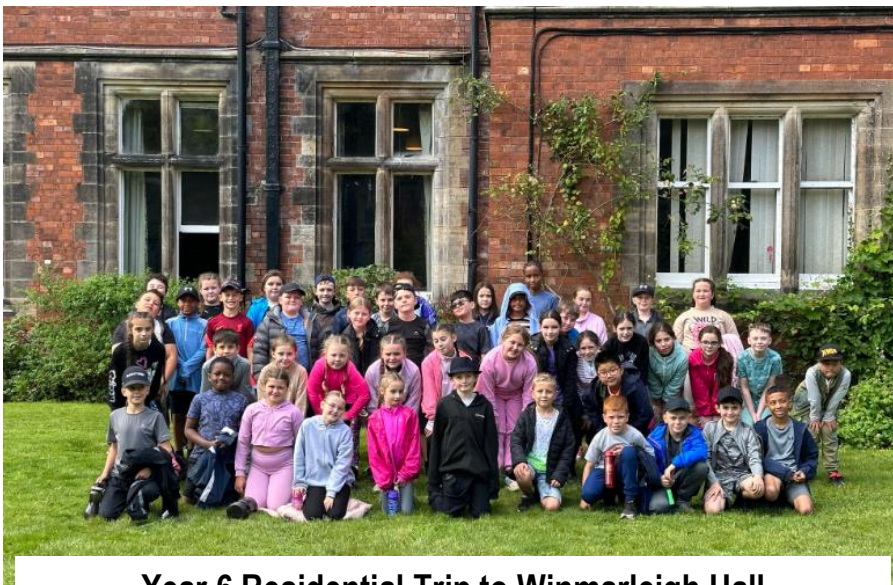
Year 6 Residential Trip to Winmarleigh Hall

Our Year 6 children visited 'Winmarleigh Hall' for 2 nights this half term. The children had many wonderful experiences. Please see inside for more pictures!