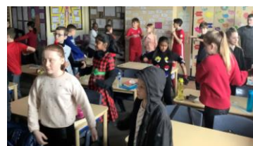
Year 6 class taking part in the live LSSP workout for Comic Relief.