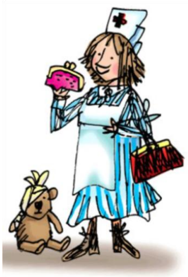
Nurse with a purse.