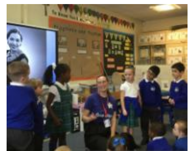
Year 1 learned about Rosa Parks

The children celebrated Black History month in October, with different year groups taking part in separate workshops. It gave all of our children the opportunity to share, celebrate and understand the impact of black heritage and culture.