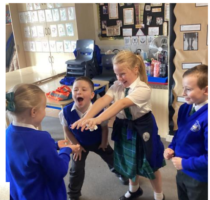
Year 3 looked at a variety of influential people, such as scientists and artists, who have impacted the world.