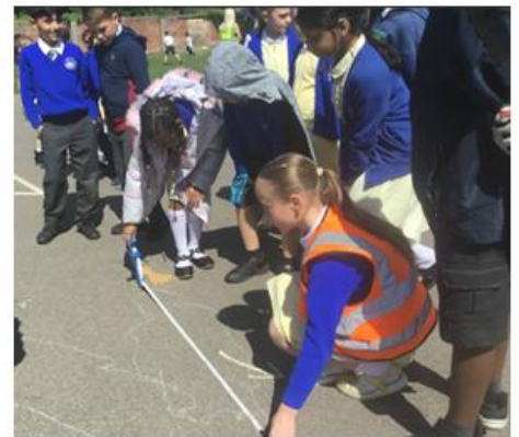
Year 3 children took advantage of the sunny weather and completed a Science Investigation discovering that the size of a shadow changes depending on the distance from the light source.