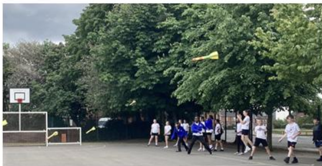
The children have also been enjoying the sunshine taking part in athletics lessons. Throwing, running and jumping.