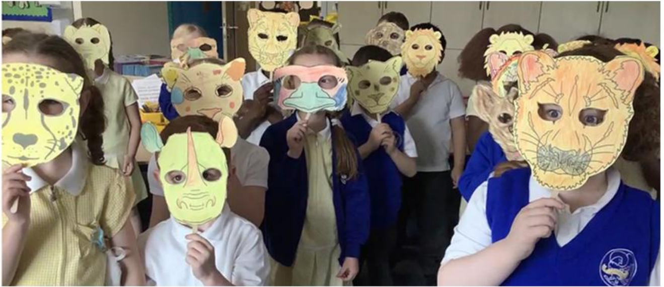
Year 1 had a jungle party after reading Giraffe's Can't Dance. We made our own masks and enjoyed dancing like Gerald the giraffe.