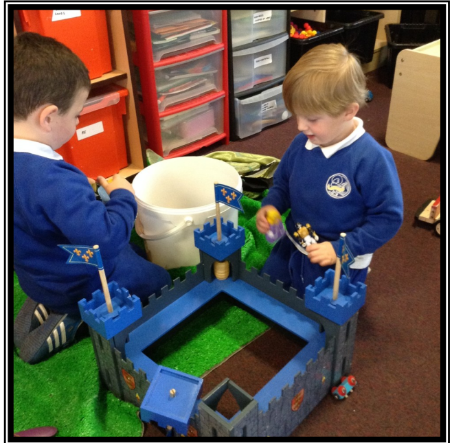
Manning the fort!