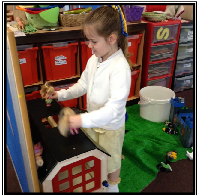
We just love playing with the dolls, creating stories and adventures!