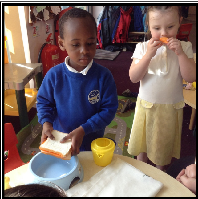
Enjoying our new kitchen area! Anyone for a sandwich?