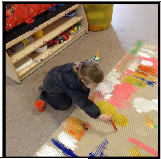
Quiet please! Artists at work!