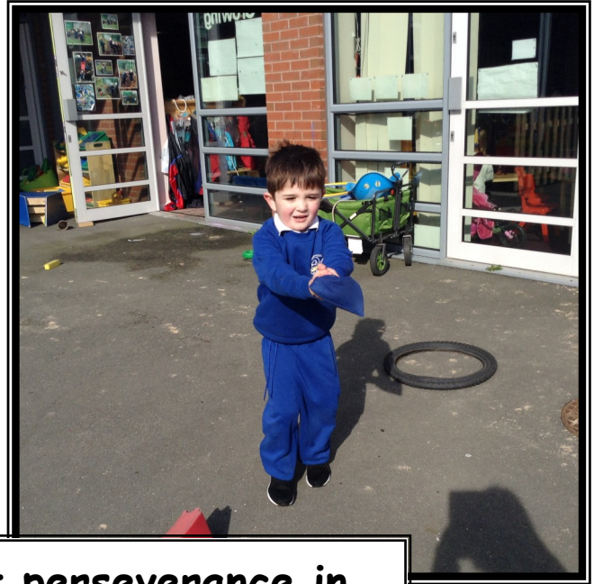
I have shown great perseverance in practising throwing and catching the beanbag!