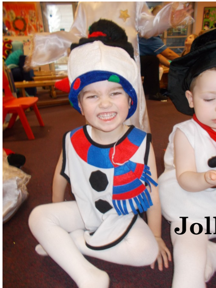
Jolly St John's Snowmen!