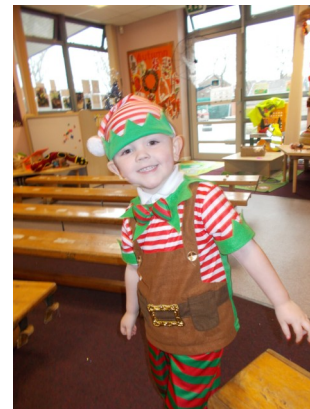
Our happy Christmas Elf!