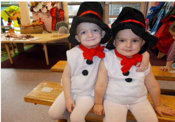
2 little snowmen sitting in a row. Each had a hat and a big red bow!