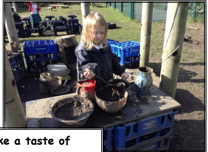
Would anyone like a taste of our lovely cooking?