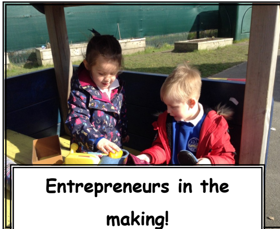
Entrepreneurs in the making!